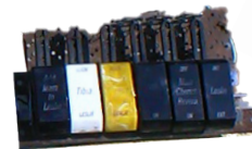
Pipe Organ Manometers

Source: Northeast Waste Management Officials' Association (NEWMOA)