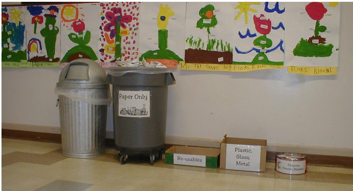
Photo: A sorting station at an elementary school in Oregon.

A sorting station is a full set of recycling, reuse and trash bins. That way, a student will be able to sort his/her stuff in one place. You can have one or more of those depending on the number of lockers and convenience. For instance, you can set up one sorting station in a central area such as a gymnasium or field house – or place multiple stations on the locker floors.